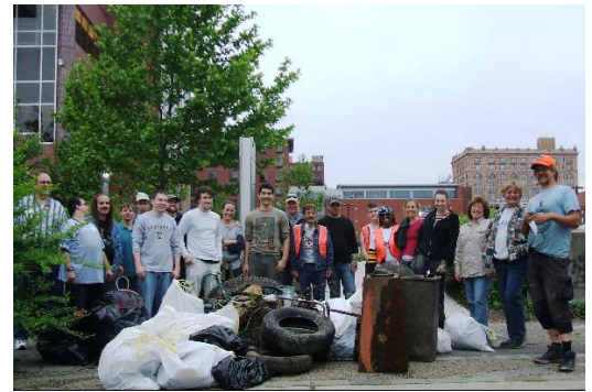
Volunteers after a job-well-done along the Strip District Trail on May 23, 2008!

Upcoming events for Riverfronts Naturally can be found on our calendar list. Click here for the calendar and lend a hand! Next date is July 11th. Click here for details!